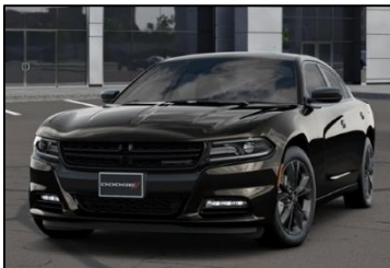
Photo of similar vehicle.