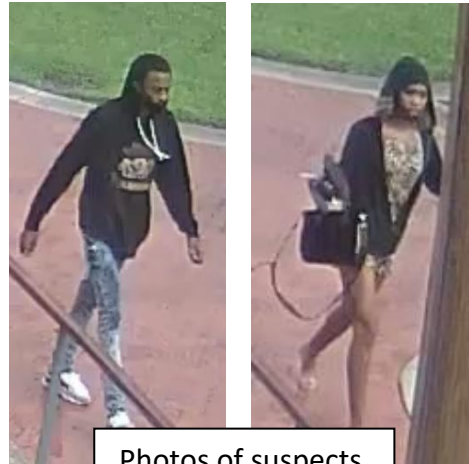
Photos of suspects.